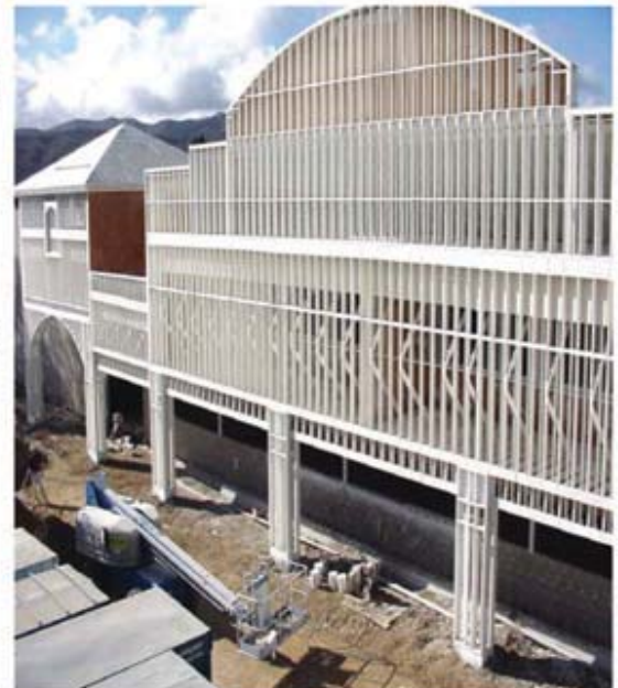
Vons Market, CA