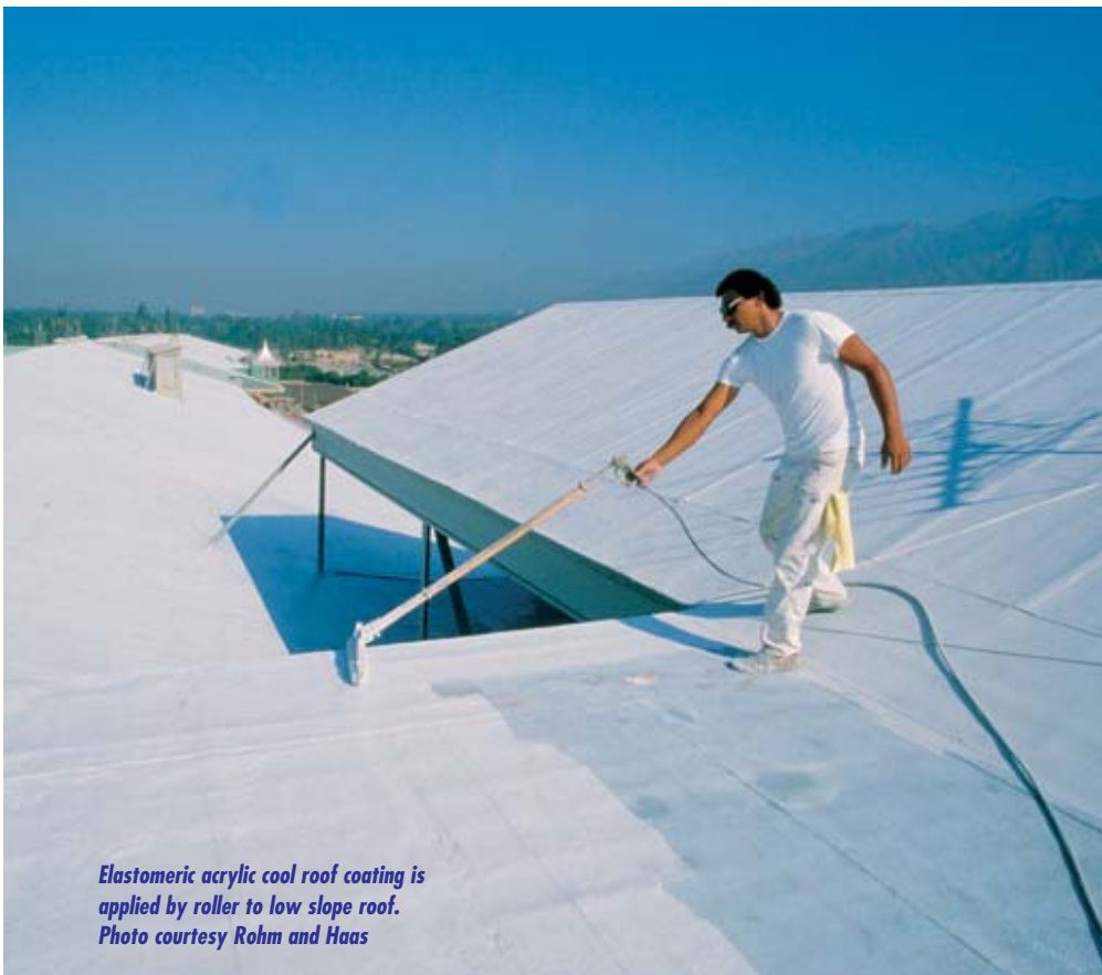
Elastomeric acrylic cool roof coating is applied by roller to low slope roof.

Report from experts at Lawrence Berkeley Laboratory offers evidence of technology's emerging significance